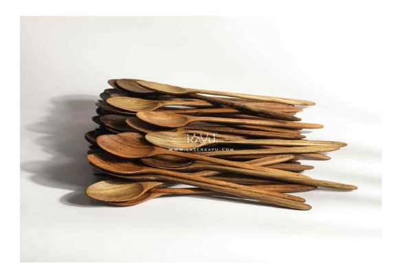
Fig. 3. Waste products in the form of functional objects (spoons). Adapted from permission of Laser Kayu (2023b).