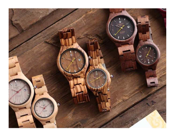
Fig. 4. Waste products in the form of jewelry (watches).