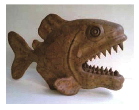
Fig. 5. Waste products are ornamental objects (e.g., fish). Adapted from Eskak (2016) with CC-BY.

In Jepara, some businesses focus only on producing furniture, rather than making other products as well. However, some businesses focus on souvenir production (Sofiana, 2011). The furniture production business has been in operation for a long time and is sustainable today. Wood and wood culture are viewed as material and cultural heritage, respectively (Han and Lee, 2021). Furthermore, furniture production activities continue so that space is available to develop new products. Some of these new products have been used to optimize wood