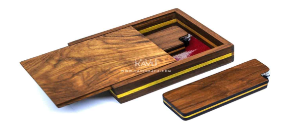
Fig. 1. Waste products in the form of souvenirs (match holders). Adapted from permission of Laser Kayu (2023a).

In addition to the limited supply of wood, social and