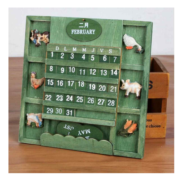
Fig. 2. Waste products in the form of decorative and functional objects (wooden calendars).

cultural factors also influence the emergence of various alternative types of wood (Puspita et al. , 2016). The furniture and furniture industry needs to pay serious attention to wood waste management to create awareness and facilitate understanding within the wood furniture manufacturing industry about how much wood is wasted in the production process and how this translates in financial terms, how wood waste can be reduced, what can and cannot be recycled, and what services are available to help businesses recycle (Daian and Ozarska,